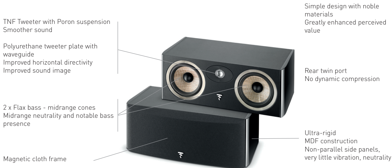
Aria CC 900 Black High Gloss

The Aria CC 900 2-way center speaker can be easily combined with the front speakers of the range. The CC 900 was developed with particular attention to timber matching in order to obtain sonic coherence and homogeneity for all kinds of configurations. Recommended for rooms measuring from 215ft 2 (20m 2 ) and for a listening distance of 10ft (3m).