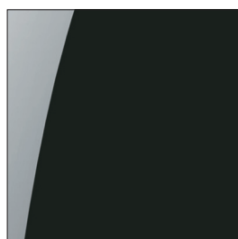
Black High Gloss