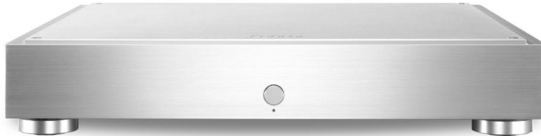
HFAS1-XS20U 2.0TB SSD

One year after the HFAS1's debut: Introducing a high-end model sporting the "X"