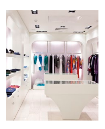
The RE650.2 is the most powerful X-tended loudspeaker. It may be installed in larger spaces, such as this clothing store.

With the X-tended series, the future can be yours today. A strong example of new technology: aluminium woofers, swivel tweeters and an extensive sound filter. Ideal for use in kitchens and bathrooms. You'll enjoy deep basses and clear reproduction.