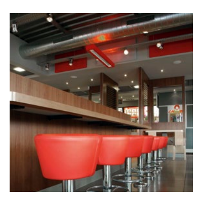
A bar or pub is just what we need to get us into the right mood! Why not add a bit of extra power to help things along?